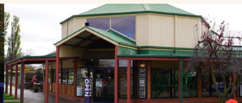
BUNGENDORE WOOD WORKS GALLERY

13 Gibraltar St. Strathmore is a striking High Victorian house built in 1890 with a wide veranda complete with French doors and wrought-iron lacework. The house next door was built around the same time and originally housed a residence and a saddlery shop. The stables at the rear were used for horses of the Australian Light Horse Bungendore Division.