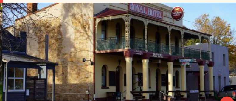
THE ROYAL HOTEL

25 Butmaroo St. Located on the other side of Butmaroo Street, St Philip's Anglican Church was built in the early 1860s in Gothic Revival style, designed to accommodate 100 worshippers. The elms of the church are over a hundred years old.