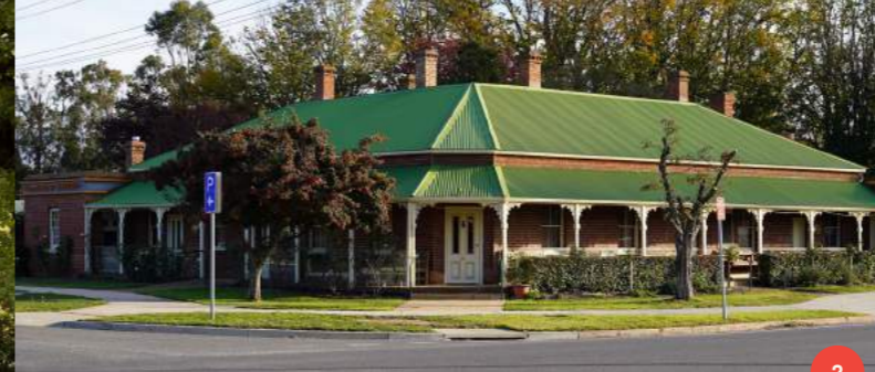
THE CARRINGTON INN

41 Molonglo St. This luxurious two storey, early Colonial style house dates back to 1861. Over the years, the building has seen many owners and many uses. In its early days, it served as a family residence as well as a dry goods store. The building has since been restored and is now the Old Stone House B&B, a small boutique hotel and wedding venue with a beautiful cottage garden.