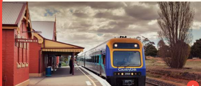
BUNGENDORE RAILWAY STATION

23-25 Malbon St. The Bungendore Village Square is a collection of colonial-style shops around a leafy courtyard, situated conveniently along the Kings Highway. While some of the buildings were refurbished in 2006, many of them, such as the cafe on the corner, date back to the late 1800s. These days, the square houses a range of specialty shops and eateries.