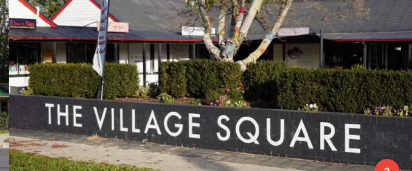
THE VILLAGE SQUARE