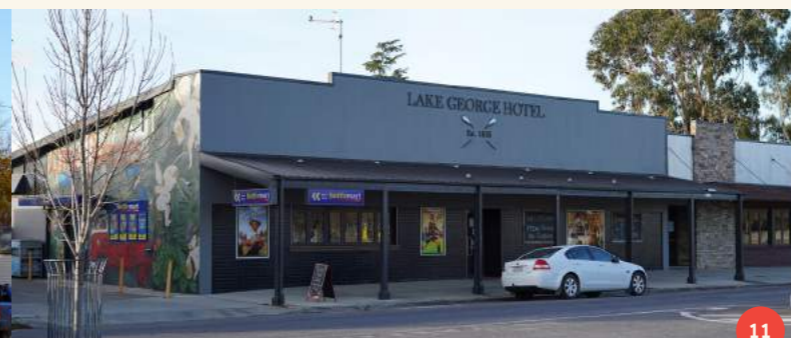
THE LAKE GEORGE HOTEL

34 Gibraltar St. The Royal Hotel of Bungendore was established in 1882. It was constructed in preparation for the rail connection, which reached Bungendore in 1885. To this day, Bungendore has been an important crossroads linking Goulburn, Braidwood, Queanbeyan, Canberra and Cooma.