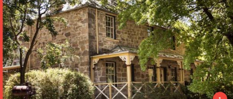
THE OLD STONE HOUSE B&B

Known for its unique gift shops and galleries, charming cafes and award-winning cool-climate wines, the town offers visitors a sweet escape from the city life. Take this town walk to get to know the heart of the village, while making the most of the galleries, antiques and gift shops on offer. Enjoy some hearty country fare for lunch along the way, or pick up some goodies at the local produce markets. There's plenty of hidden gems to discover in Bungendore.