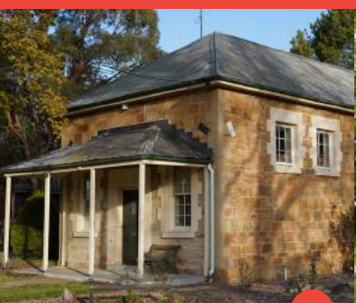
THE POLICE STATION

53 Gibraltar St. This post office dates to 1882. However, the mail service in Bungendore first commenced decades earlier in 1836, as the town became part of the Queanbeyan coach route. The first post office was built four years later in 1840.