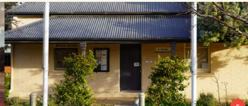
BUNGENDORE PRIMARY SCHOOL

20 Majara St. Built in 1885, the Bungendore Railway Station was a railhead until the line reached Queanbeyan in 1887. The station has since been beautifully preserved with its distinctive red bricks a prominent feature in the townscape. Daily railway and coach services to Sydney and Canberra are still available from the station.