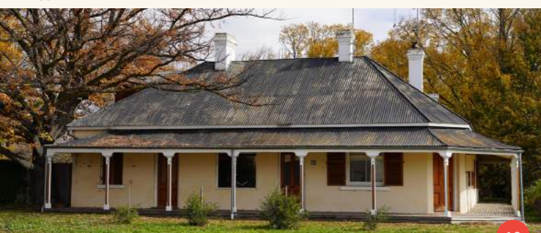
THE ORIENTAL BANK

18 Gibraltar St. This building, now housing a popular bakery, was built in the mid-1850s and stands next to two other buildings dating back to the town's earlier days; on the left is a former cottage known as 'Duart' from late 1800s, and the triple-front shop building next door dates back to the 1920s.