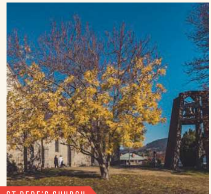
ST BEDE'S CHURCH

You can also find hidden handmade treasures and fresh local produce at Braidwood's frequent farmers' markets, usually held the 1st and 3rd Saturday of each month.